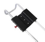
12128 Adjustable system for headrest of Meber-X and Mercury stretchers