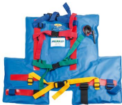
9162 Arm vacuum splint with 14 independent chambers