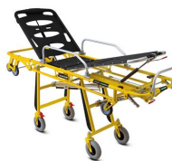
Frog 7210 "FROG" yellow self loading stretcher with trendelenburg