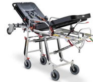
Mercury Lite Cinque 7095/4RG Proof Certified aluminium 5 levels self-loading stretcher with 4 swivel wheels