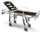
MBS-01 MEBER BARIATRIC STRETCHER 7270 Self loading stretcher for bariatric transport