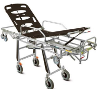
Frog 7240 PROOF "FROG PLUS" self loading stretcher with trendelenburg certified