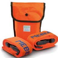
604/MEB Orange bag with 2 straps with plastic buckle and ME.BER. ribbon