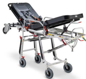
Mercury Lite Cinque 7095/4RG Proof Certified aluminium 5 levels self-loading stretcher with 4 swivel wheels