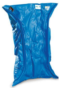
6300/B Vacuum mattress for veterinary use