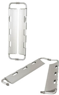
Maxima 6200 Pediatric anti trauma scoop stretcher