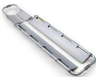
Maxima 631 Grey anodized anti trauma scoop stretcher with head/trunk in 1 pc