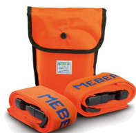
604/MEB Orange bag with 2 straps with plastic buckle and ME.BER. ribbon