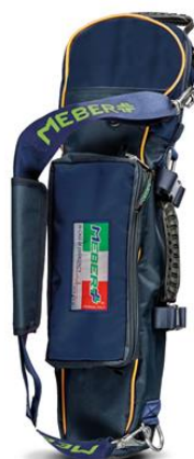
12072/BG "COVER OX 5 BG"- professional cylinder holder for 5 lt oxygen bottles