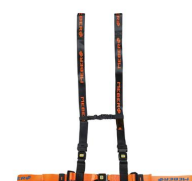
612/AN-2/MEB Adjustable thoracic abdominal belt orange/black with MeBer band and