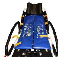
12154 "BEAR PODS" Bariatric containment system for self-loading stretchers