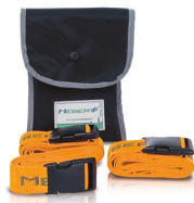
584 Black bag with 3 orange straps in 2 pcs and quick-release plastic buckle for Ergon stretcher