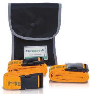
584 Black bag with 3 orange straps in 2 pcs and quick-release plastic buckle for Ergon stretcher