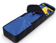
16150-001 Winch bag for Ergon