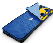
16150-002 Storage bag for Ergon stretcher