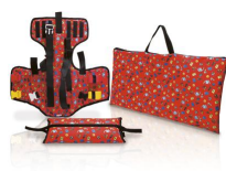
Med Ped 9120 Pediatric spinal immobilizer