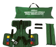
Med 899 Spinal immobilizer