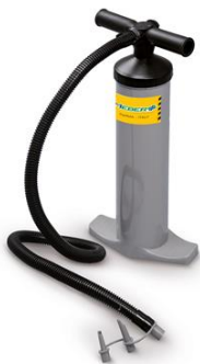
896/DF Abs aspiration pump