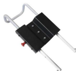
12128 Adjustable system for headrest of Meber-X and Mercury stretchers