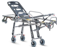
Frog 7240 PROOF "FROG PLUS" self loading stretcher with trendelenburg certified