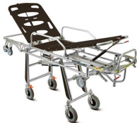
Frog 7240 PROOF "FROG PLUS" self loading stretcher with trendelenburg certified