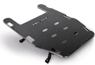
12080 "MPB" wide bariatric platform for self-loading stretchers Frog Mercury and Gecko complete of belts with reel and fixing for stretcher