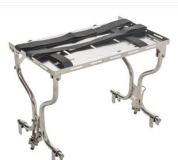
939 Instrument support for stretchers