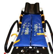
12154 "BEAR PODS" Bariatric containment system for self-loading stretchers