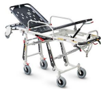
Mercury Lite 7082/4RG Proof Certified aluminium variable height stretcher high version with 4 rotating wheels