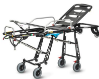
Mercury EL 7092 PROOF Certified self-loading stretcher