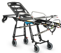
Mercury EL 7094 PROOF Certified self-loading stretcher - high version