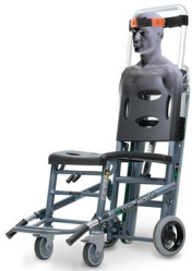
670-001 Orange/black head immobilizer for Extra stair chair