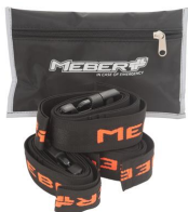
566 Black bag with 3 belts in 2 pieces made of black ribbon with orange MeBer logo for Extra chairs