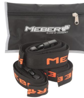
566 Black bag with 3 belts in 2 pieces made of black ribbon with orange MeBer logo for Extra chairs