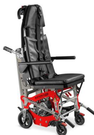
Extra Ergolift FX 675 Fixed frame powered Stair Chair suitable for transportation