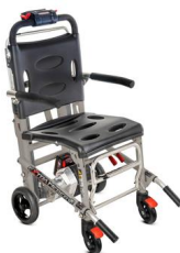
Extra Ergolift 671 Powered stair chair