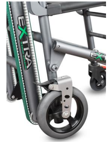
670-004 Castor with brake diam. 200 mm for Extra chair