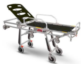
MBS-01 MEBER BARIATRIC STRETCHER 7270 Self loading stretcher for bariatric transport