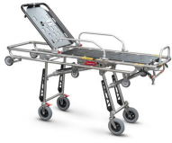
MBS-01 MEBER BARIATRIC STRETCHER 7270 Self loading stretcher for bariatric transport