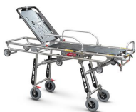
MBS-01 MEBER BARIATRIC STRETCHER 7270 Self loading stretcher for bariatric transport