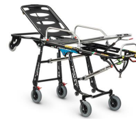
Mercury EL 7094 PROOF Certified self-loading stretcher - high version