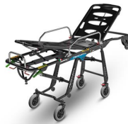
Mercury EL 7092 PROOF Certified self-loading stretcher