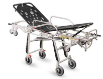
7265 Proof Aluminium self loading stretcher "Frog lite Advance" with extractable handles and Trendelenburg