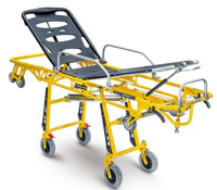
Frog 7210 PROOF "FROG" yellow self loading stretcher with trendelenburg certified