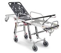
Mercury Lite Cinque 7095/4RG Proof Certified aluminium 5 levels self-loading stretcher with 4 swivel wheels