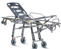
Frog 7240 PROOF "FROG PLUS" self loading stretcher with trendelenburg certified