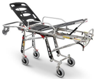
Mercury 7070/4RG PROOF Stainless steel variable height stretcher certified with 4 rotating wheels