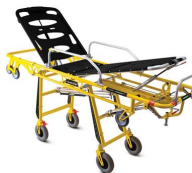
Frog 7210 PROOF "FROG" yellow self loading stretcher with trendelenburg certified