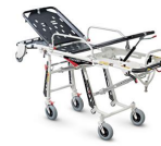
Mercury Lite 7080/4RG Proof Ambulance cot in aluminium with variable height and four swivel castors