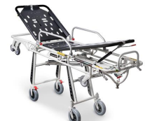
Frog Lite 7260 PROOF "FROG LITE" self loading aluminium stretcher with trendelenburg certified