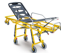
Frog 7210 "FROG" yellow self loading stretcher with trendelenburg