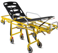
Frog 7210 "FROG" yellow self loading stretcher with trendelenburg