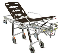
Frog 7240 PROOF "FROG PLUS" self loading stretcher with trendelenburg certified