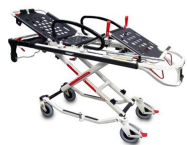
MeBer-X 7300 "MeBer-X" Multi-level stretcher complete with mattress and belts