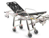
7265 Proof Aluminium self loading stretcher "Frog lite Advance" with extractable handles and Trendelenburg