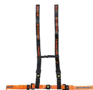
612/AN-2/MEB Adjustable thoracic abdominal belt orange/black with MeBer band and 4 points fastening for self loading stretchers and sedan chairs