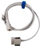
11224 Pediatric sensor for Oxytest