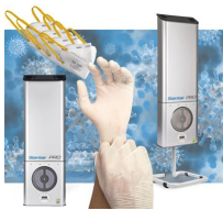
Prevention and individual protection