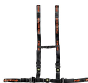
612/N-2/MEB Adjustable thoracic abdominal belt black with MeBer band with 4 points fastening for self loading stretchers and sedan chairs