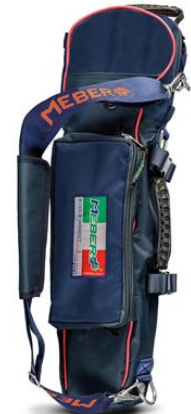
12072/BR "COVER OX 5 BR"- professional cylinder holder for 5 lt oxygen bottles