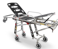
Mercury 7070/4RG PROOF Stainless steel variable height stretcher certified with 4 rotating wheels