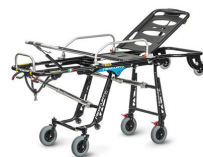
Mercury EL 7092 PROOF Certified self-loading stretcher