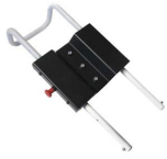
12128 Adjustable system for headrest of Meber-X and Mercury stretchers