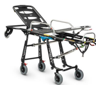
Mercury EL 7094 PROOF Certified self-loading stretcher - high version