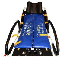
12154 "BEAR PODS" Bariatric containment system for self-loading stretchers