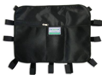
12025 Black multi usage object holder for automatic loading stretcher