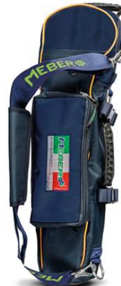
12072/BG "COVER OX 5 BG"- professional cylinder holder for 5 lt oxygen bottles