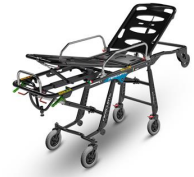
Mercury EL 7092 PROOF Certified self-loading stretcher