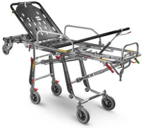
Mercury Cinque 7075/4RG PROOF Certified 5 levels self-loading stretcher with 4 swivel wheels