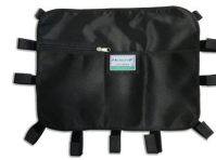
12025 Black multi usage object holder for automatic loading stretcher