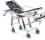
Mercury Lite 7080/4RG Proof Ambulance cot in aluminium with variable height and four swivel castors