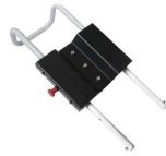
12128 Adjustable system for headrest of Meber-X and Mercury stretchers