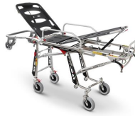
Mercury 7070/4RG PROOF Stainless steel variable height stretcher certified with 4 rotating wheels