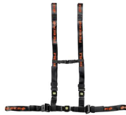
612/N-2/MEB Adjustable thoracic abdominal belt black with MeBer band with 4 points fastening for self loading stretchers and sedan chairs