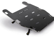
12080 "MPB" wide bariatric platform for self-loading stretchers Frog Mercury and Gecko complete of belts with reel and fixing for stretcher