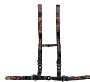
612/N-2/MEB Adjustable thoracic abdominal belt black with MeBer band with 4 points fastening for self loading stretchers and sedan chairs