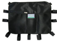
12025 Black multi usage object holder for automatic loading stretcher