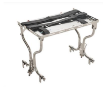
939 Instrument support for stretchers