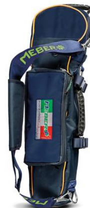
12072/BG "COVER OX 5 BG"- professional cylinder holder for 5 lt oxygen bottles