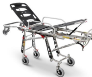
Mercury 7072/4RG PROOF Certified stainless steel variable height stretcher high version with 4 rotating wheels