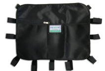
12025 Black multi usage object holder for automatic loading stretcher