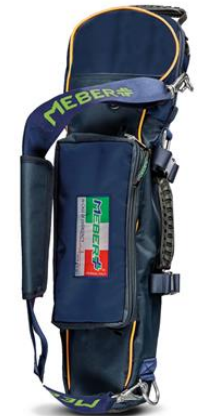
12072/BG "COVER OX 5 BG"- professional cylinder holder for 5 lt oxygen bottles