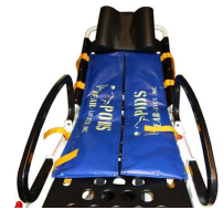
12154 "BEAR PODS" Bariatric containment system for self-loading stretchers