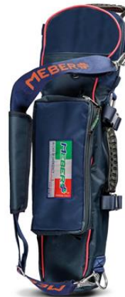
12072/BR "COVER OX 5 BR"- professional cylinder holder for 5 lt oxygen bottles