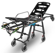
Mercury EL 7092 PROOF Certified self-loading stretcher