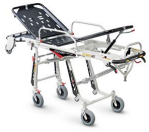
Mercury Lite 7080/4RG Proof Ambulance cot in aluminium with variable height and four swivel castors