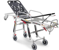
Mercury Lite 7080/4RG Proof Ambulance cot in aluminium with variable height and four swivel castors