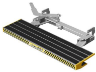
DynaStep 19300 1120 mm mechanical step DynaStep