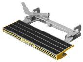
DynaStep 19302 800 mm mechanical step DynaStep