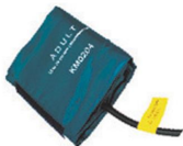
8548-004 Bracciale adulto per monitor multiparametrico PC-300