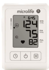
B1 CLASSIC 8534 Automatic blood pressure with adult cuff