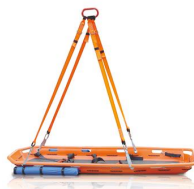
16100-005 Certified lifting sling for Toboga stretchers