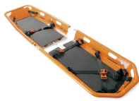
Toboga 16102 Detachable with straps and foot rest