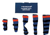
407 "NEOFIX" Neoprene splints set with case