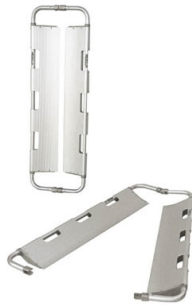
Maxima 6200 Pediatric anti trauma scoop stretcher