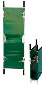
6100 Long folding stretcher