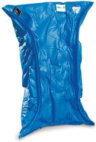
6300/B Vacuum mattress for veterinary use