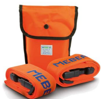
604/MEB Orange bag with 2 straps with plastic buckle and ME.BER. ribbon