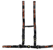
612/N-2/MEB Adjustable thoracic abdominal belt black with MeBer band with 4 points fastening for self loading stretchers and sedan chairs