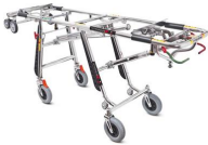
Titanus 7062/4RG PROOF Stainless steel variable height trolley with four rotating wheels high version