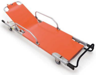
Fixed stretcher 1510 PROOF Fixed stretcher with nylon cover