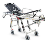
Mercury Lite 7080/4RG Proof Ambulance cot in aluminium with variable height and four swivel castors