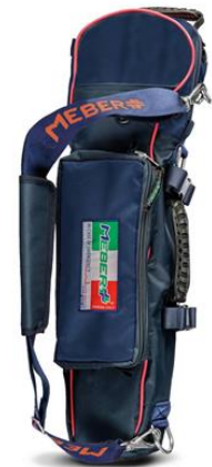
12072/BR "COVER OX 5 BR"- professional cylinder holder for 5 lt oxygen bottles