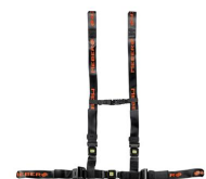
612/N-2/MEB Adjustable thoracic abdominal belt black with MeBer band and 4 points fastening for self loading stretchers and sedan chairs