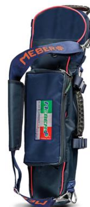
12072/BR "COVER OX 5 BR"- professional cylinder holder for 5 lt oxygen bottles