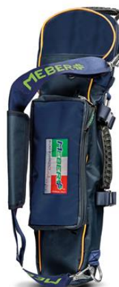
12072/BG "COVER OX 5 BG"- professional cylinder holder for 5 lt oxygen bottles