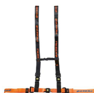
612/AN-2/MEB Adjustable thoracic abdominal belt orange/black with MeBer band and 4 points fastening for self loading stretchers and sedan chairs