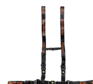
612/N-2/MEB Adjustable thoracic abdominal belt black with MeBer band with 4 points fastening for self loading stretchers and sedan chairs