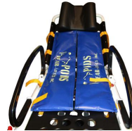
12154 "BEAR PODS" Bariatric containment system for self-loading stretchers