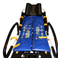
12154 "BEAR PODS" Bariatric containment system for self-loading stretchers