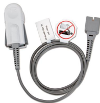
11206 Adult sensor for pulse oximeter Vital Test