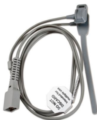
11208 Pediatric sensor for pulse oximeter Vital Test