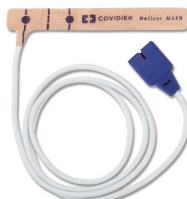
11212 Neonatal sensor for pulse oximeter Vital Test