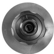
894-001 Aspiration valve for vacuum splints and mattress