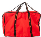
890-001 Carrying case for vacuum mattress