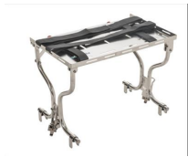
939 Instrument support for stretchers