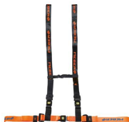
612/AN-2/MEB Adjustable thoracic abdominal belt orange/black with MeBer band and 4 points fastening for self loading stretchers and sedan chairs