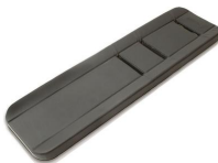
7013/N 3 pcs. Skay fire-proof electrowelded mattress