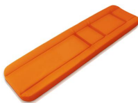
7013/A 3 pcs. Skay fire-proof electrowelded mattress