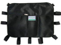
12025 Black multi usage object holder for automatic loading stretcher