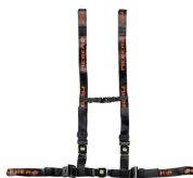
612/N-2/MEB Adjustable thoracic abdominal belt black with MeBer band with 4 points fastening for self loading stretchers and sedan chairs