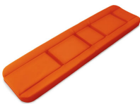
7014/A 4 pcs. Skay fire-proof electrowelded mattress