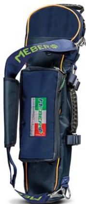
12072/BG "COVER OX 5 BG"- professional cylinder holder for 5 lt oxygen bottles