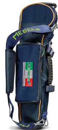
12072/BG "COVER OX 5 BG"- professional cylinder holder for 5 lt oxygen bottles