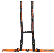
612/AN-2/MEB Adjustable thoracic abdominal belt orange/black with MeBer band and 4 points fastening for self loading stretchers and sedan chairs