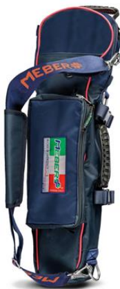
12072/BR "COVER OX 5 BR"- professional cylinder holder for 5 lt oxygen bottles