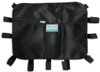
12025 Black multi usage object holder for automatic loading stretcher