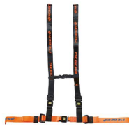
612/AN-2/MEB Adjustable thoracic abdominal belt orange/black with MeBer band and 4 points fastening for self loading stretchers and sedan chairs