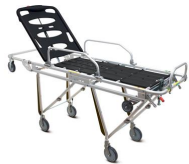
Winner 910 PROOF Self loading stretcher - certified