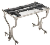
939 Instrument support for stretchers