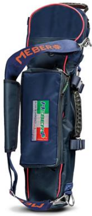
12072/BR "COVER OX 5 BR"- professional cylinder holder for 5 lt oxygen bottles