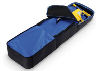
16150-001 Winch bag for Ergon