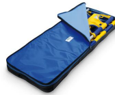
16150-002 Storage bag for Ergon stretcher