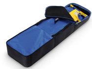
16150-001 Winch bag for Ergon