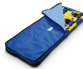
16150-002 Storage bag for Ergon stretcher