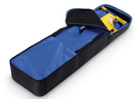
16150-001 Winch bag for Ergon