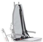
610 Thoracic-abdominal belt with four fastening for padded chair