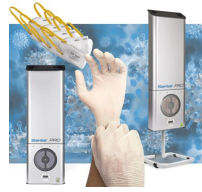
Prevention and individual protection