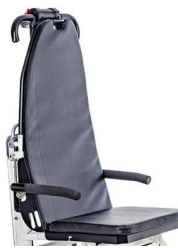
12118 Mattress for Extra and Ergolift chairs' transformation kit into fixed chairs